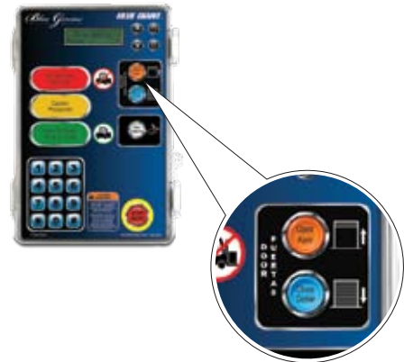
Blue Genius™ – combo with door buttons shown.